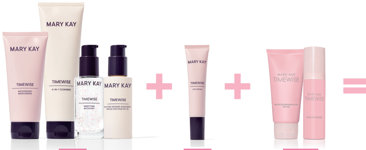
NEW! TimeWise ® Miracle Set

NEW! BEYOND ULTIMATE TIMEWISE ® MIRACLE SET