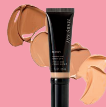
CC CREAM $22