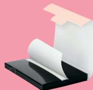
OIL-ABSORBING TISSUES $8