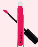
LIP GLOSS $16