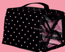
TRAVEL ROLL-UP BAG $36