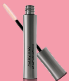
WATERPROOF MASCARA $16