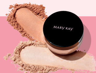
SILKY SETTING POWDER $20