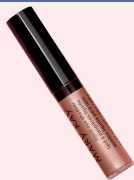
LIQUID EYE SHADOW $16