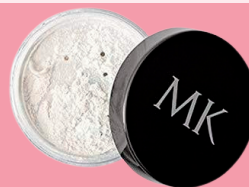
TRANSLUCENT LOOSE POWDER $18