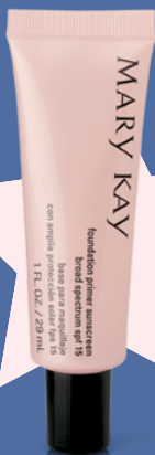
FOUNDATION PRIMER $20