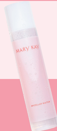
MICELLAR WATER $18