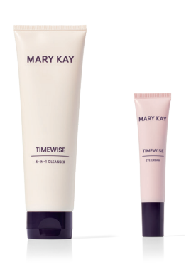
TimeWise* TimeWise* 4-in-1 Cleanser Eve Cream