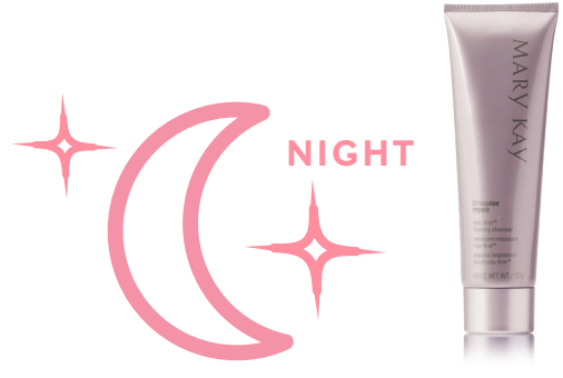
TimeWise Repair® Volu-Firm® Foaming Cleanser